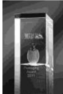
The trophy 2011